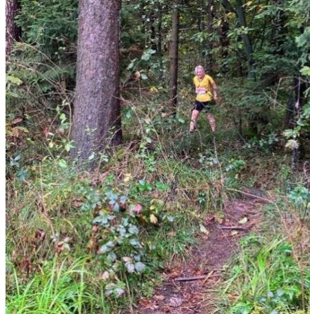
It's not just bears!