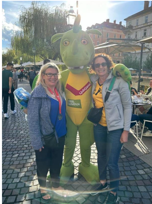
1 - Spot the dragon

DATA had succeeded in already upsetting DAME who gets stressed travelling by deciding to take a work call just as they were leaving the house. DATA takes an early lead in the "Don't Upset Your Partner" league table although he was later to get strong competition from NODDY, WALLY and ENGINE.